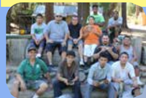
Sugar Pine Fishing