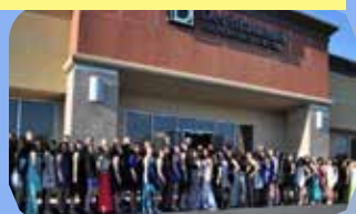
DMIG Hosting Prom