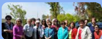
Lunch with Dorcus Group