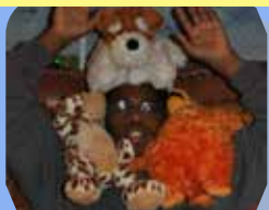
Assistance League Fresno & Mountain Bear Fan Club Stuff Animal Donations