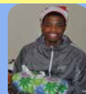
Binky Patrol Blankets