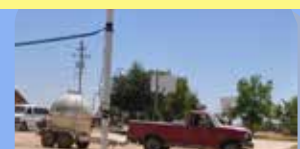
Igal Sharing Water