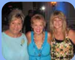
The Z Team