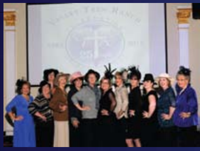
11th Annual Fashion Show Luncheon. Hats were Fabulous!