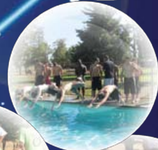
The Annual VTR/KYJO Summer Olympics. They all went for the gold!