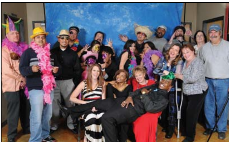
(Below) Valley Teen Ranch staff at the Prom in April, 2012. "A team that plays together, stays together."