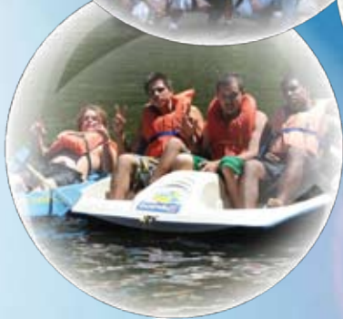
Summer camp at Calvin Crest