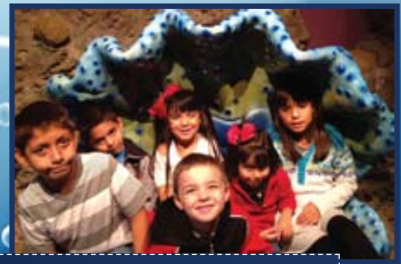
Foster Families on vacation in beautiful California making new memories with our children