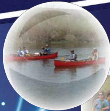
Canoeing on the SJ River with the Parkway Team