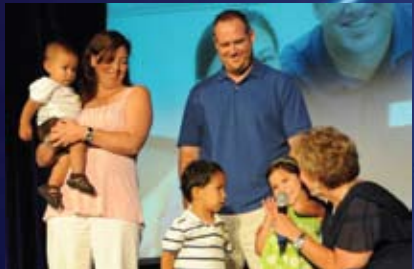
The Walker family at the Anniversary celebration