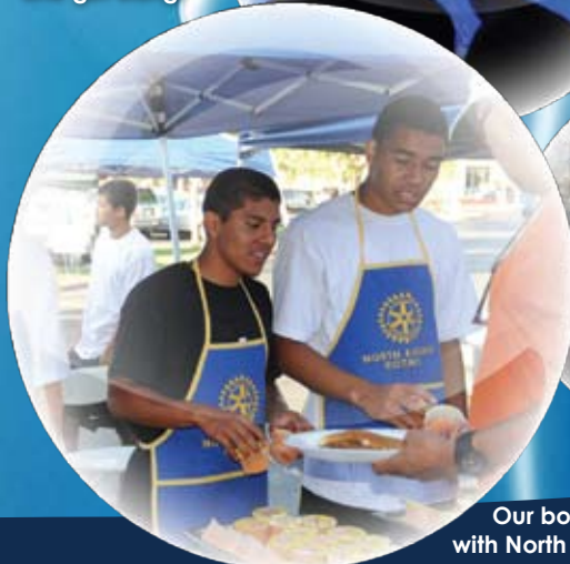
Our boys serving breakfast with North Fresno Rotary. "Service above self"