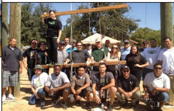
(Right) Valley Teen Ranch Staff Retreat (Part II) on the high ropes course. "The more we work together, the happier we'll be."