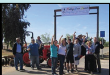
▲ CART Advanced Communication Prgm.