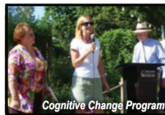
Cognitive Change Program