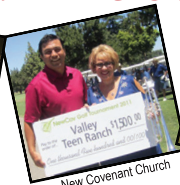
New Covenant Church