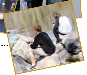
Camping ... Snowboarding ... Fishing ...