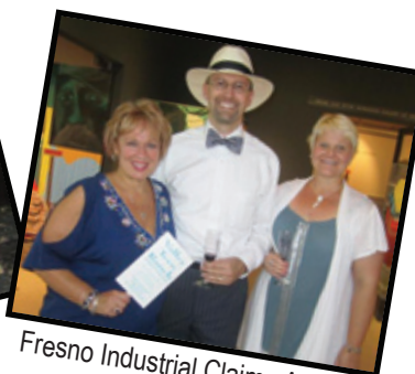
Fresno Industrial Claims Assoc.