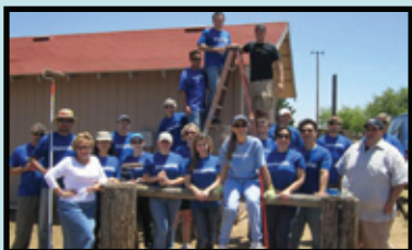
▲ Deloitte & Touche Impact Day 2011