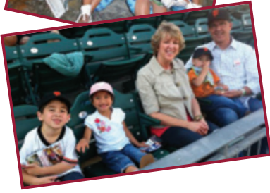
Monterey Bay Aquarium ... Wild Water Adventures ... Fresno Grizzlies ...