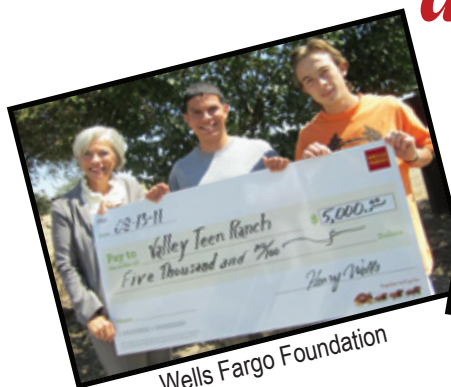
Wells Fargo Foundation