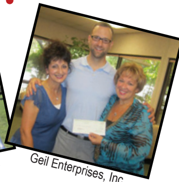
Geil Enterprises, Inc.