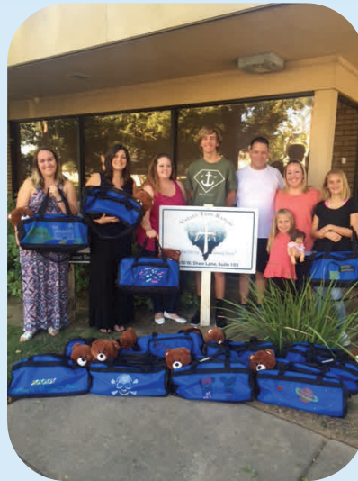
Price Family Duffel Bag Donation