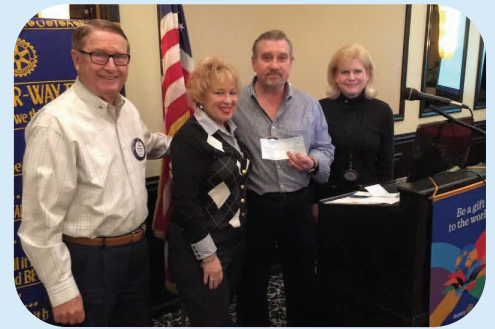
Fig Garden Rotary