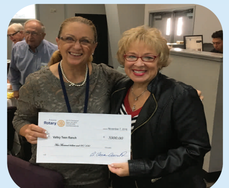
Greater Fresno Rotary