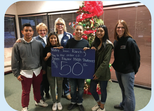
Fowler High School Students Christmas Donation