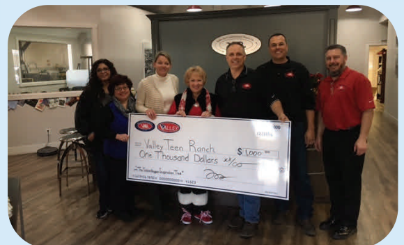
Valley Air Conditioning & Repair Christmas Donation