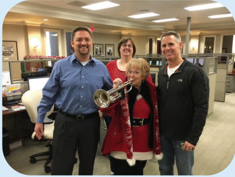
Der Manouel Insurance Christmas Treats