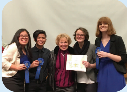
C.A.R.T. Students Winning Book Project