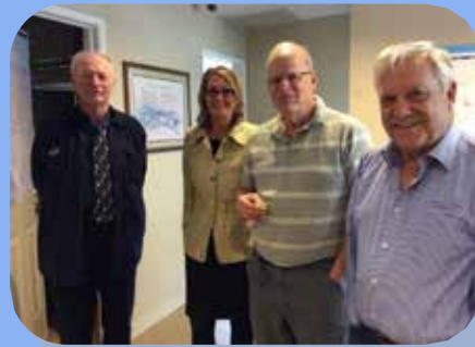
Volunteers for Mock Interviews