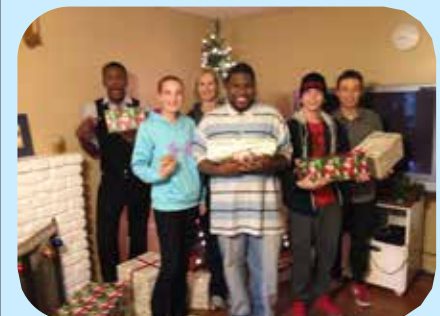
Transitional Living Christmas