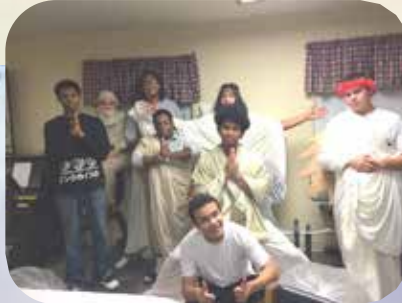
House 1 Christmas Play