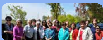
Lunch with Dorcus Group