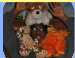
Assistance League Fresno & Mountain Bear Fan Club Stuff Animal Donations