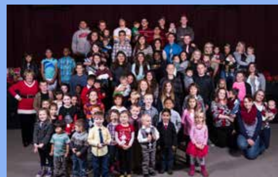
FFA & Adoption Agency Christmas Party: December 14, 2014