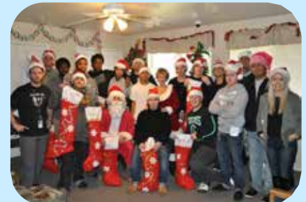
House 3 Christmas