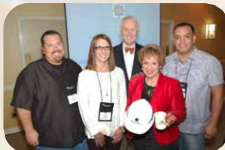
California Alliance Recognition