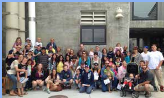
Monterey Bay Aquarium