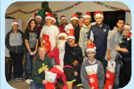
House 2 Christmas