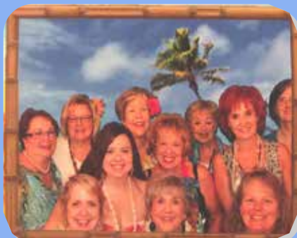
Angel Guild Fashion Show/Luncheon