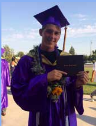
DJ: Class of 2014