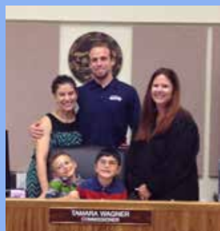
The Cooks finalized their adoption in Riverside County on August 22, 2014