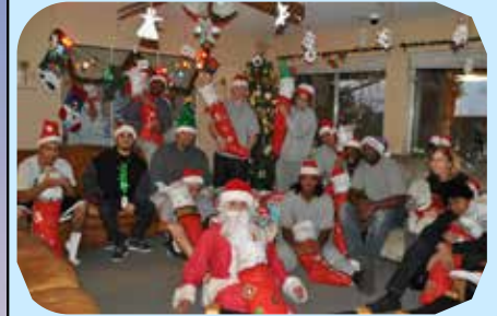
House 1 Christmas