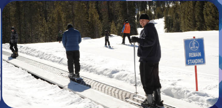
▲ Ski Fun at China Peak Mountain Resort ▲