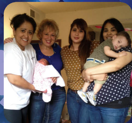
▲ Four generations as a result of Valley Teen Ranch