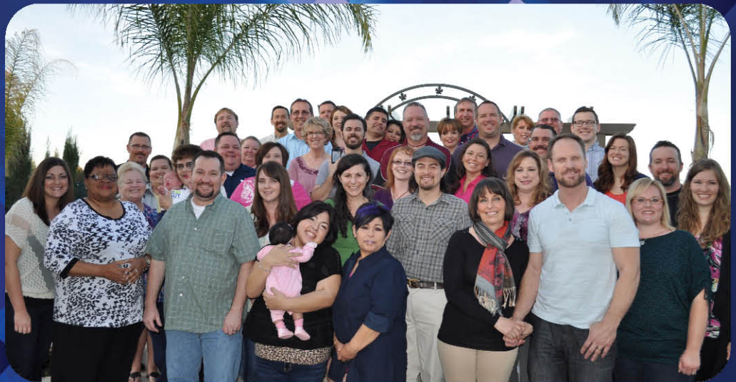
▲ Our amazing foster and adoptive families!