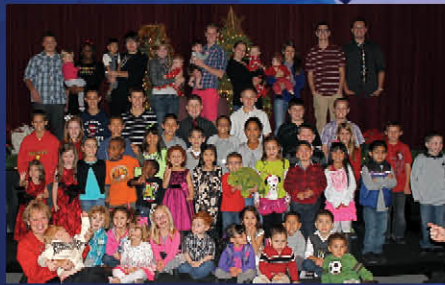
FFA Christmas Celebration!

Merry & Bright! We couldn't do it without YOU!