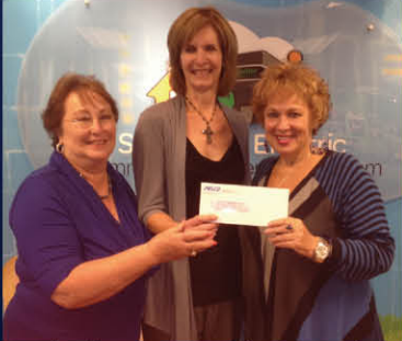
Thank you to our friends at Pelco!