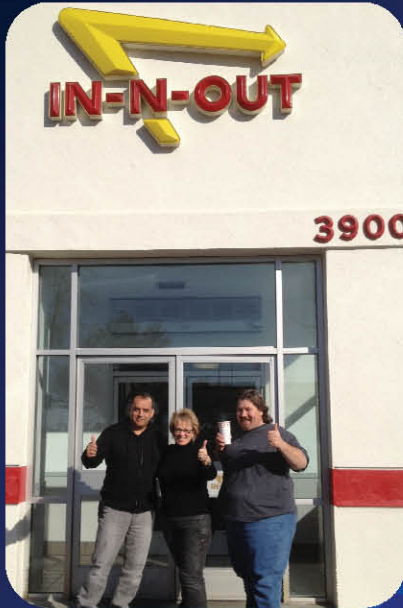
▲ Thanks In-N-Out for supporting Valley Teen Ranch!