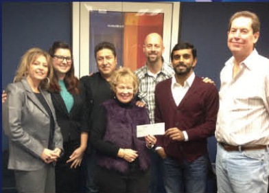
Our friends at Providential Real Estate