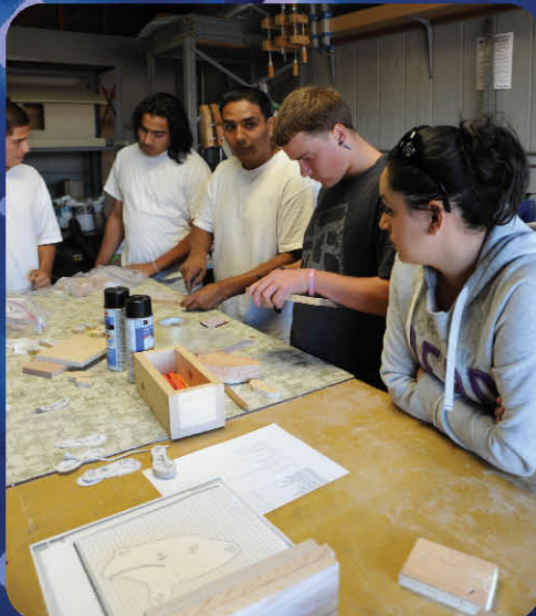
▲ The boys learning some woodworking skills