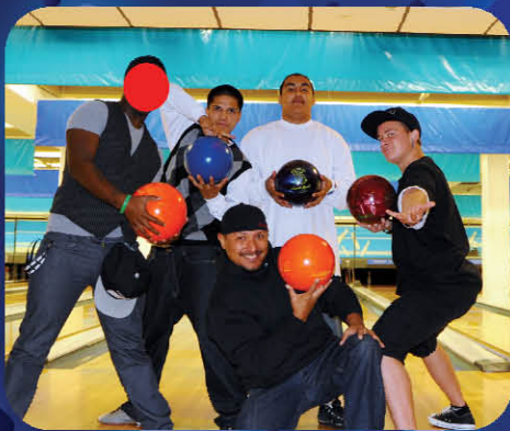
▲ Our boys enjoying a friendly game of bowling