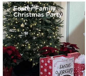
Foster Family Christmas Party