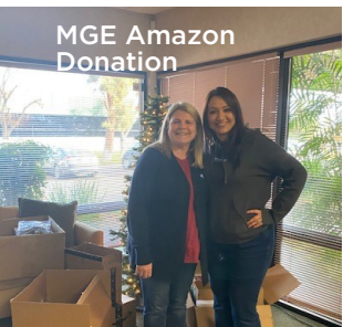
MGE Amazon Donation